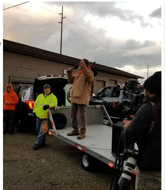
BCTGM Local 374 G rally.

** On a positive note, a Starbucks in the Buffalo area voted to form a Union. They are the first of 9,000 locations to be unionized.