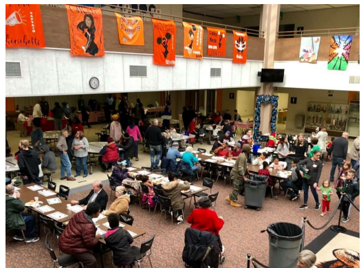
A view of the Christmas event in full swing.