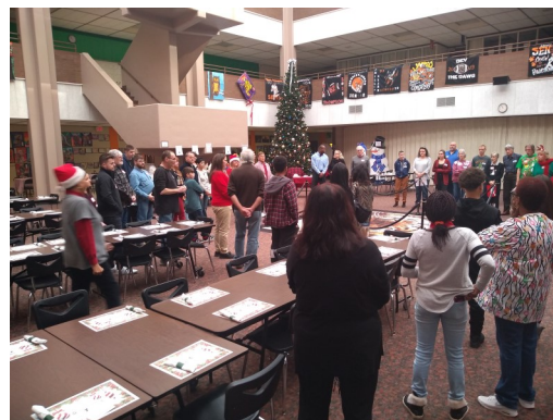
A view of the volunteers as they assembled before the Christmas event was opened to the families.