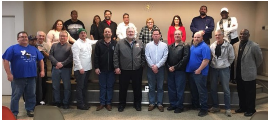
Delegates in attendance at the December 2019 CLC meeting/Christmas party.