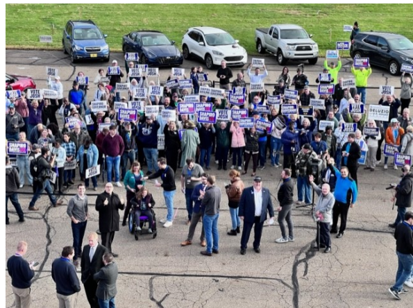
Overhead view of the crowd at the November 1st rally at IBEW 712.