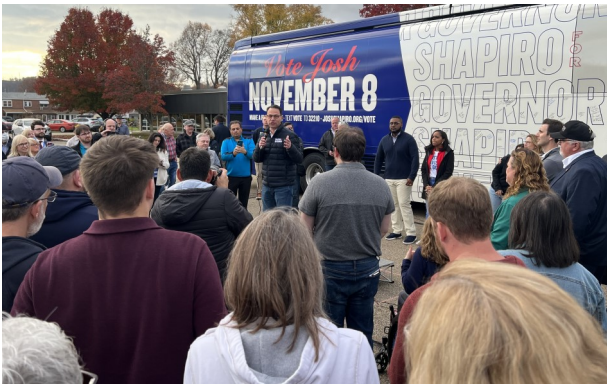
Pre-election rally on November 1st at IBEW Local 712 Edwin D. Hill Complex in Vanport.